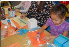
Making Numbers Using Base Ten Materials