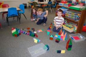
Designing a Park/Playground